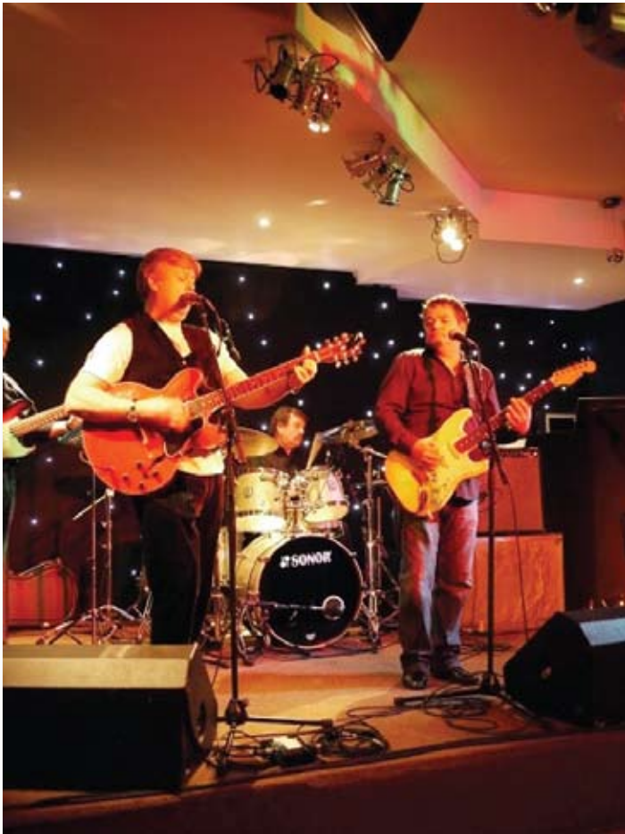
Jam 'n Jar 2009

The 2009 Jam 'n Jar the annual event at which Edinburgh's professional singers, musicians and bands come along and mix and match to provide a truly entertaining jamming session was held at the Minto Hotel on 6th December. Trefoil was most grateful to be one of their chosen charities this year and to receive a cheque for £450.